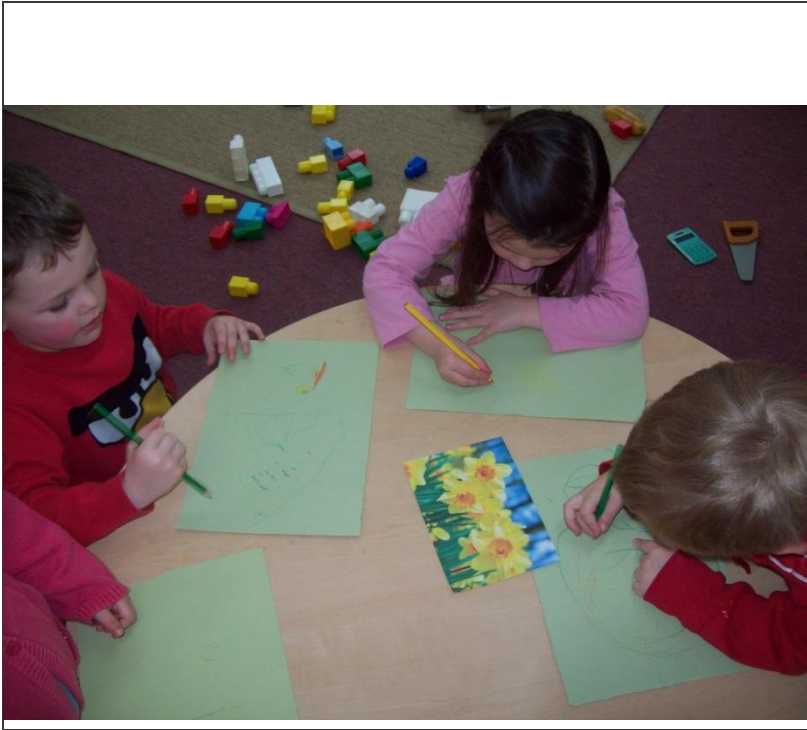
THE CHILDREN HAVE STARTED TALKING AND LEARNING ABOUT THE SPRING TIME. THEIR OBSERVATIONAL DRAWINGS OF DAFFODILS WERE AMAZING!