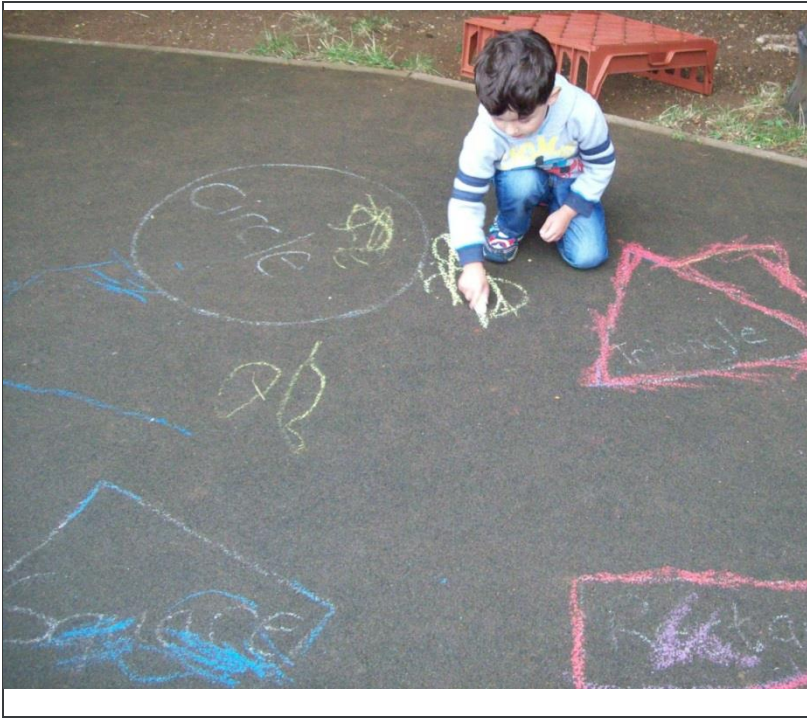
ENJOYING THE COLD, DRY WEATHER.....HAPPY AUTUMN!!!