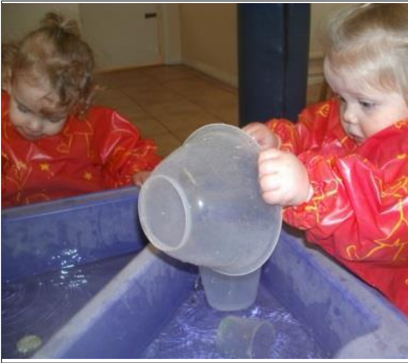
SOME OF THE BABIES EXPLORING SPLASHING, POURING AND DRIPS IN THE WATER!