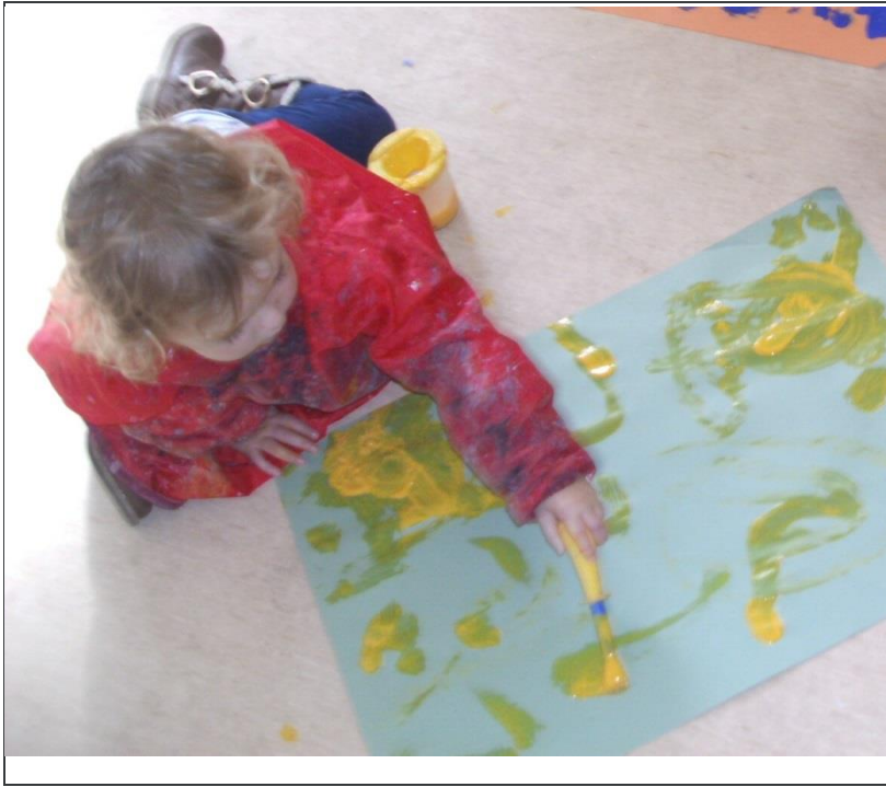
WE HAVE HAD LOTS OF FUN PAINTING, CREATING AND EXPERIMENTING!