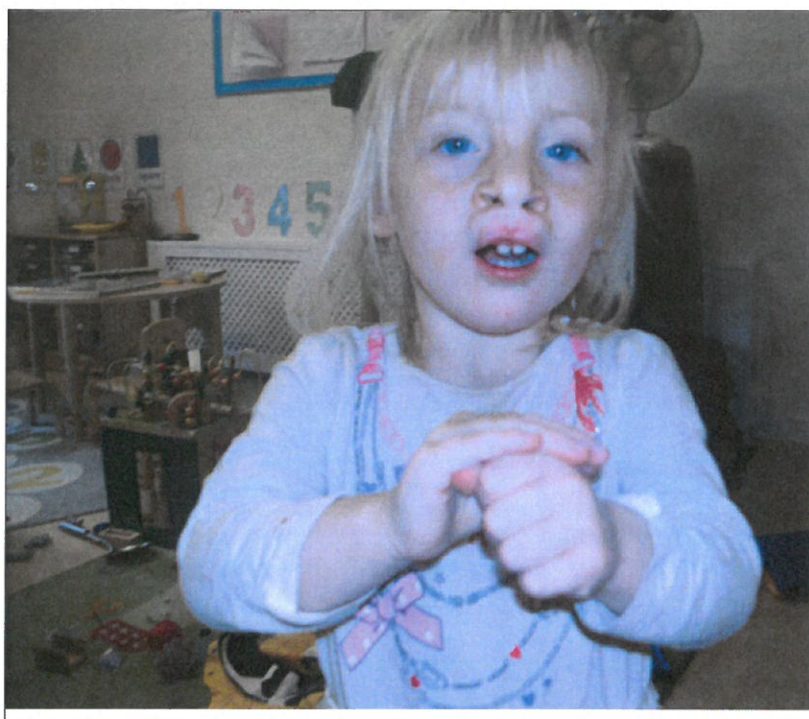
WE HAVE BEEN PRACTICING OUR SIGNS THIS IS THE SIGN FOR MORE