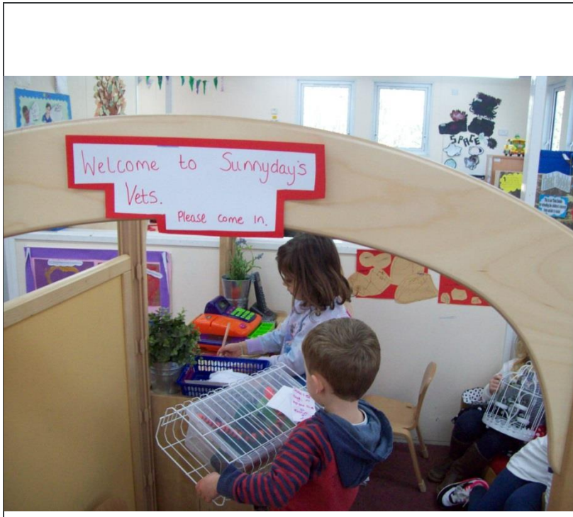
IT IS BUSY IN THE SUNNY DAYS VETS – THE RECEPTIONIST IS DOING A GREAT JOB BOOKING IN ALL OF THE PETS AND THEIR OWNERS!