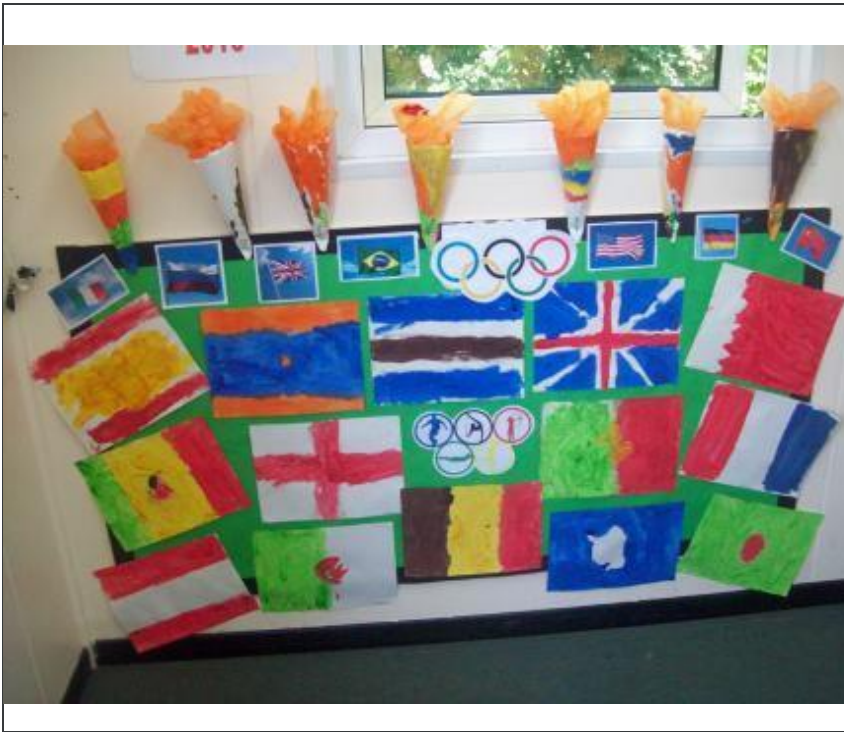
WHAT A FANTASTIC SPORTY SUMMER!