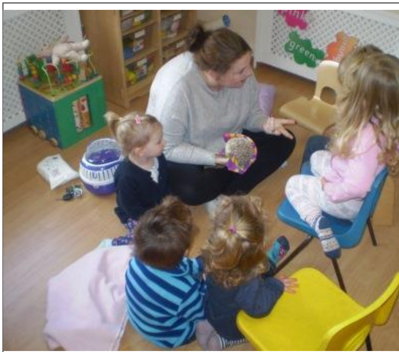
WE HAD HEDGEHOGS VISIT US.....HAPPY AUTUMN!!!