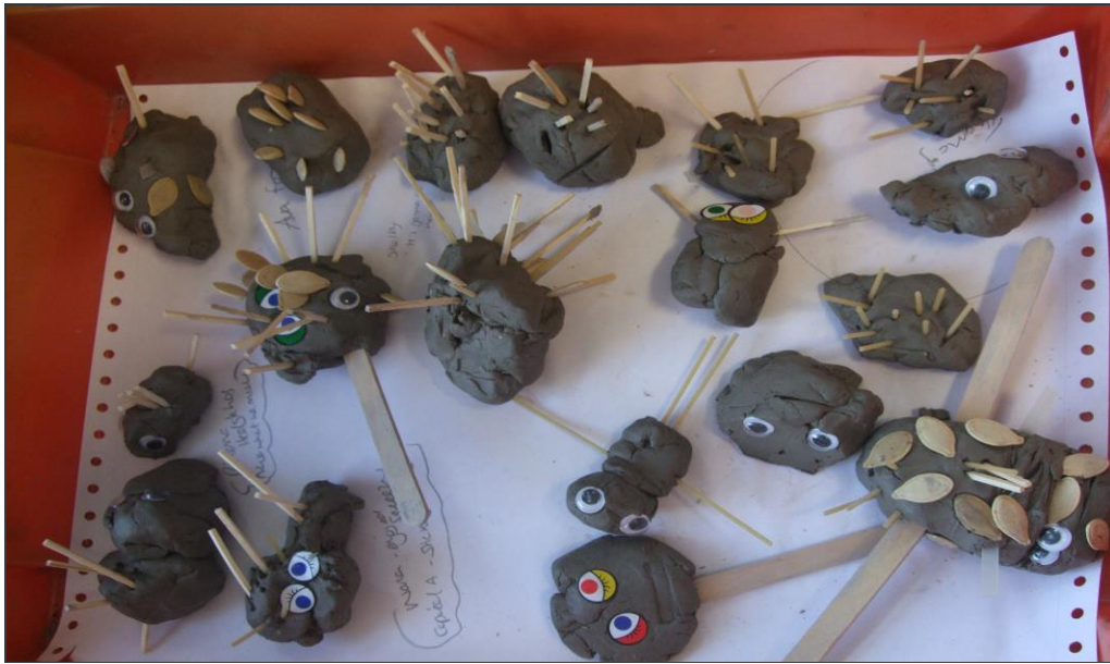
CREATIVE PLAY – WE MADE THE MOST AMAZING ANIMALS WITH CLAY; -BIRDS, DOGS, HEDGEHOGS AND FOXES .