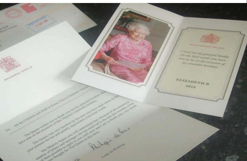
WE RECEIVED A WONDERFUL LETTER FROM THE QUEEN , THANKING US FOR OUR CARD WE SENT .