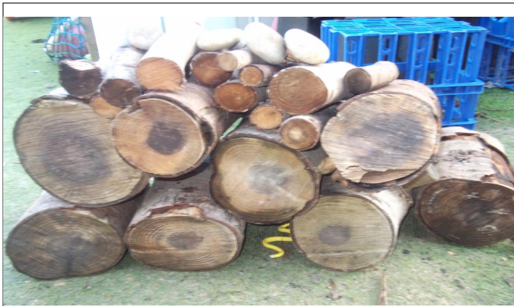
CREATIVE PLAY – THE CHILDREN BUILT A GREAT SNAKE HOUSE OUT OF LOGS THIS TERM