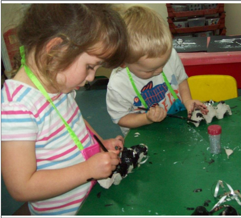
CHILDREN HAD GREAT FUN GETTING INVOLVED WITH THE CRAFT ACTIVITIES OVER THE HALF-TERM